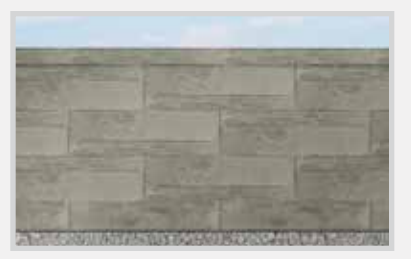
BLOCKS & CAP MIX