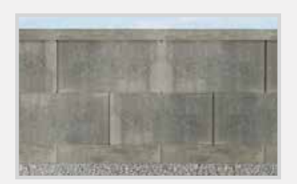
BLOCKS ON END