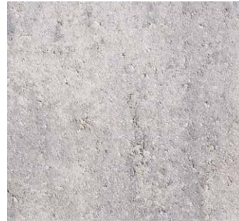
M | D N | G H T Only available in 6 x 36