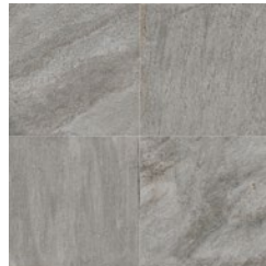
v3 MORITZ* SK 03 ST