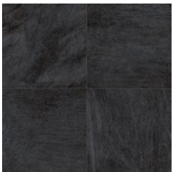
v3 MORO* SK 05 ST