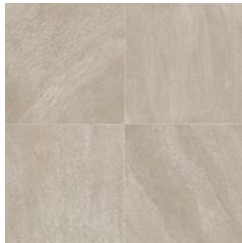
v3 RESIA SK 02 ST