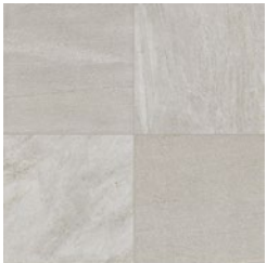
v3 BRAIES SK 01 ST