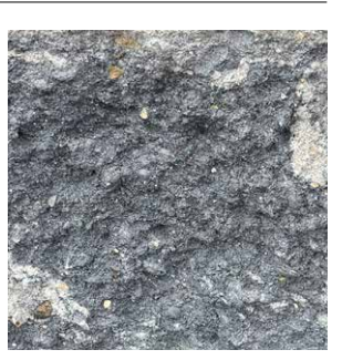
CHESTNUT TAN NEWPORT GRAY