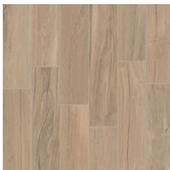
v2 MASTER JP 03