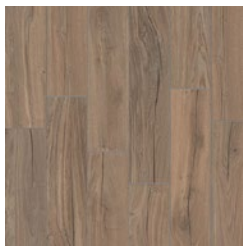
v2 CAMP JP 04

! PROPOSITION 65 WARNING: This product can expose you to chemicals including Crystalline Silica, which is known to the state of California to cause cancer, and Cadmium, which is known in the State of California to cause birth defects or other reproductive harm. For more information, go to www.P65Warnings.ca.gov .