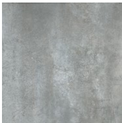
v2 EXCALIBUR LY 01 ST