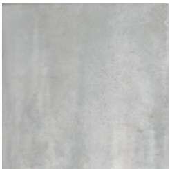
v2 NIMBUS LY 01 ST