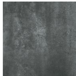
v2 KING LY 01 ST

! PROPOSITION 65 WARNING: This product can expose you to chemicals including Crystalline Silica, which is known to the state of California to cause cancer, and Cadmium, which is known in the State of California to cause birth defects or other reproductive harm. For more information, go to www.P65Warnings.ca.gov .