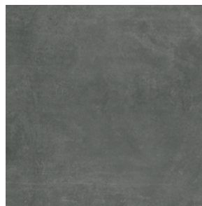
v2 CLASSIC GC 05