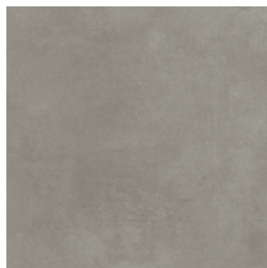
v2 IDEAL GC 03