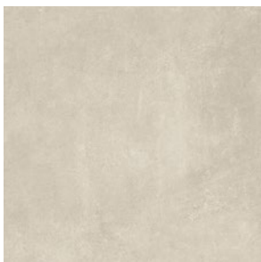
v2 CLEAR GC 01