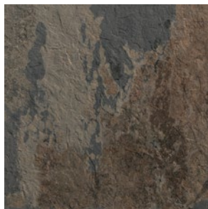
v4 AFRICAN STONE AD 03 NAT