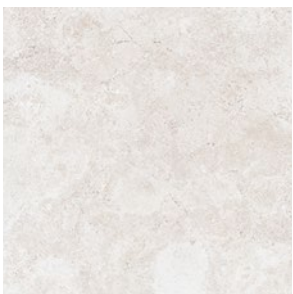
v2 BELGARD BLACNO GC 04