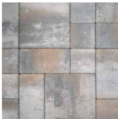
GRAY CHARCOAL TAN