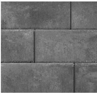
R I O Not available in cap