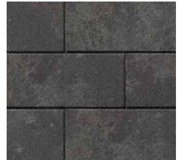
ANTHRACITE Swatches represent product color only, not dimensions and/or shape.