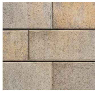
VICTORIAN Not available in cap